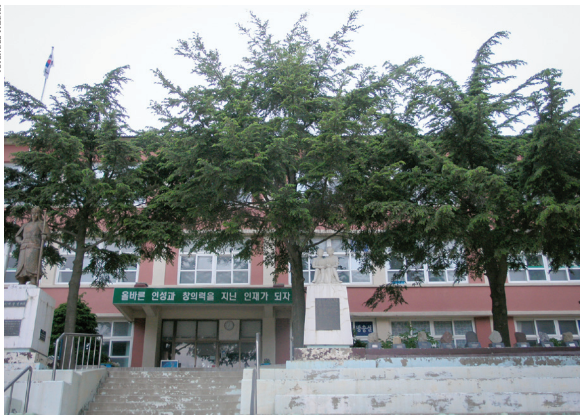
Collaborator Suk Su Lee collected Tsuga ulleungensis from the wild and planted three specimens near the elementary school in Jeodong. After Peter Del Tredici visited in the spring of 2008, Suk Su sent seed from these plants to the Arboretum, where they were propagated and planted in the landscape.

From Taeha Ryeong, we drove halfway around the island to the Nari Basin, a volcanic caldera left after an eruption that occurred about ten thousand years ago. This is now the only place on the island with relatively flat ground, so the locals have taken advantage of this fact by establishing agricultural fields devoted to the cultivation of local medicinal plants, such as Codonopsis lanceolata , a vining member of the bellflower family (Campanulaceae). The landscape was beautiful, ringed by mountains, with specimens of the Ulleungdo hemlock in the surrounding forest and Sorbus ulleungensis , an endemic mountain ash, growing at the edges of the fields. (Incidentally, the mountain ash was then considered to be S. commixta —a species that ranges through northern Japan and the islands of eastern Russia—illustrating another case where speciation on Ulleungdo was long unrecognized.) We had lunch at a vegetarian restaurant that served the traditional bibimbap dish filled with medicinal plants