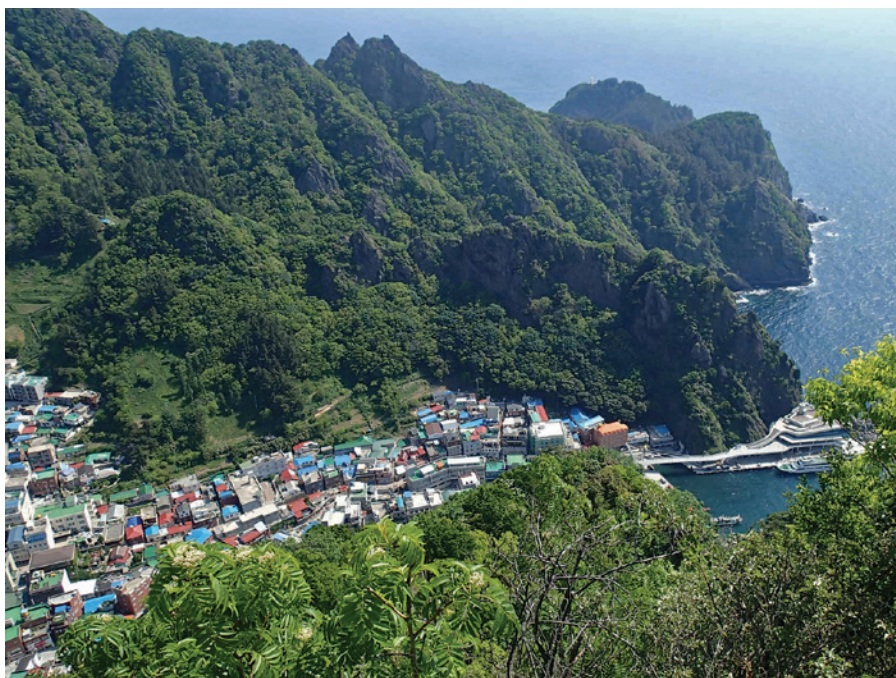
Dodong, the primary port city for Ulleungdo, is located south of Jeodong. In the foreground, Sorbus ulleungensis , an endemic mountain ash, can be seen flowering.

On the second hemlock tree we examined, Ashley found evidence of the adelgid and immediately collected samples for Nathan. We stayed in the area for a couple of hours, collecting more samples of the adelgid as well as herbarium specimens and leaf samples of the hemlocks. On the way down, the sun was setting, and we stopped at the elementary school in Jeodong, where Suk Su proudly showed us three hem-