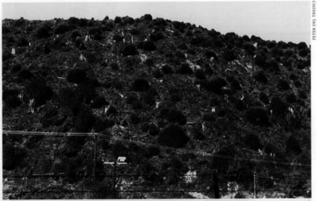
A forest of redwoods in Korbel, California, resprouting from their lignotubers three years after clear-cutting.