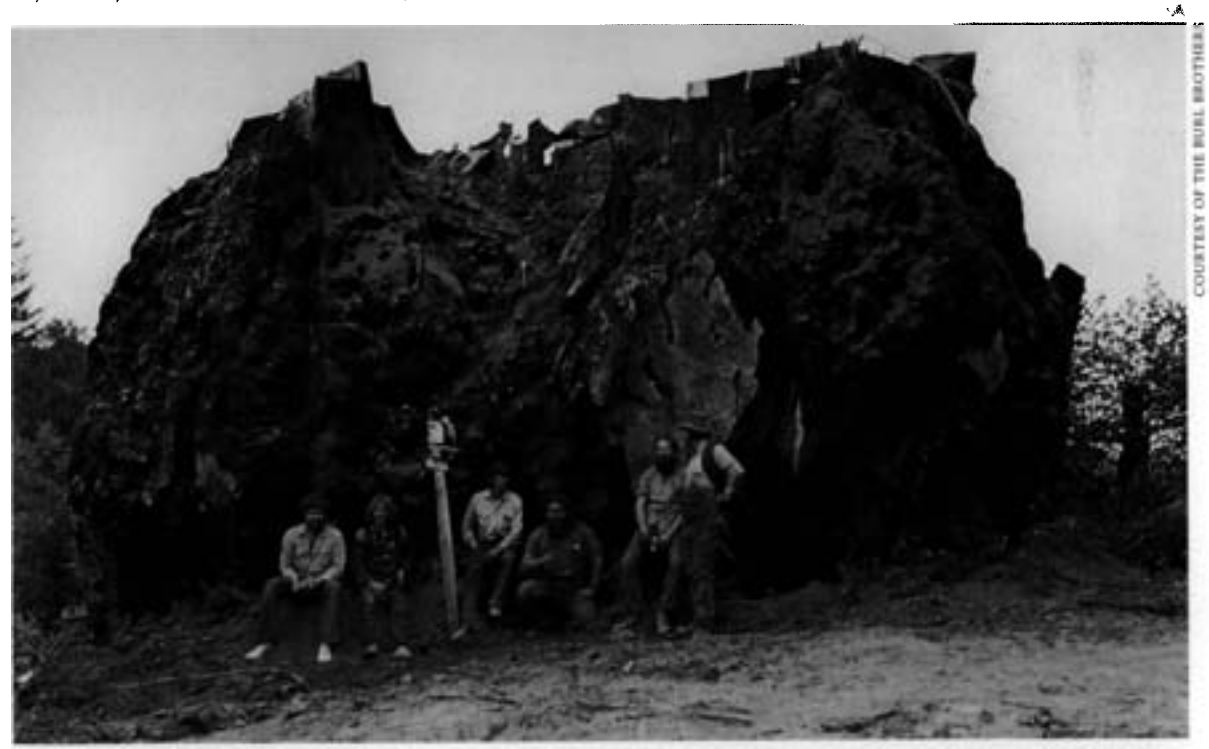
A postcard showing what is believed to be the largest Sequoia lignotuber ever reported. It was 41 feet across, weighed approximately 525 tons, and supported at least seven large trunks The burl was uncovered in 1977 at Big Lagoon near Eureka, California.