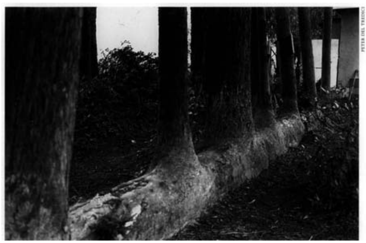
Unlike most redwoods that sprout from the basal lignotuber, this unusual specimen has sprouted along the entire length of its prostrate trunk, producing a linear grove of trees