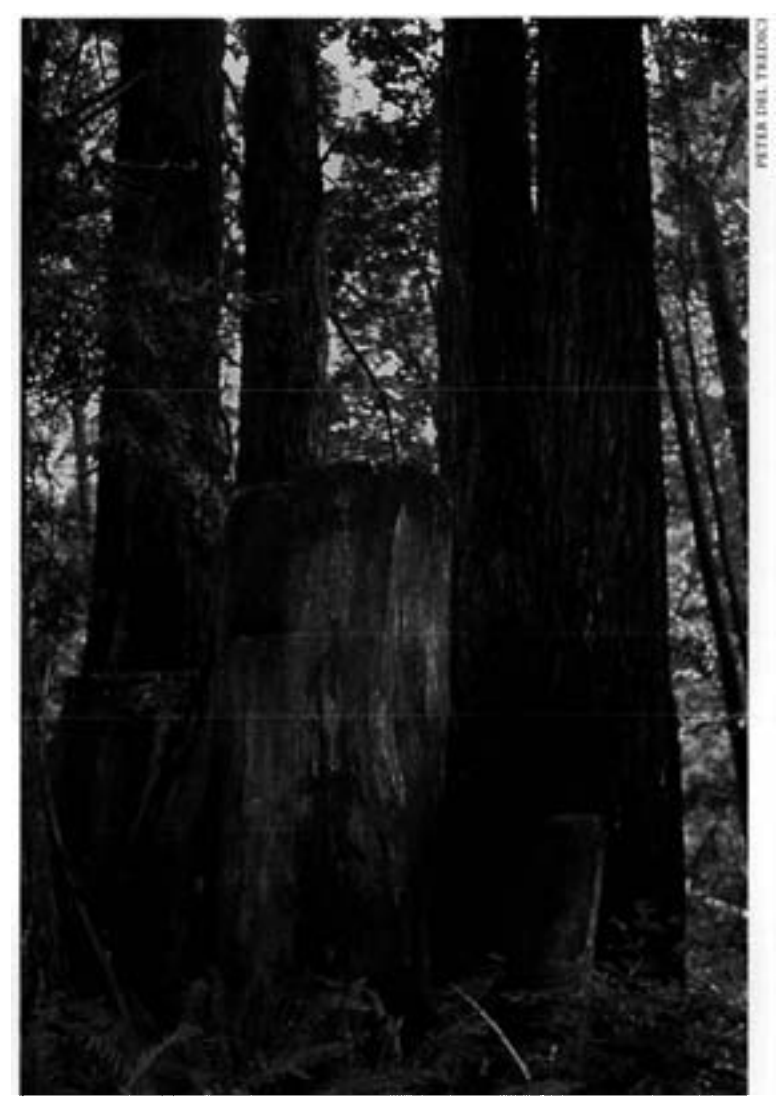
A ring of "second generation" redwoods that sprouted from the lignotuber after the primary trunk was logged approximately one hundred years ago

The remarkable ability of redwood trees to resprout from lignotubers, regardless of age, is clearly the basis for the redwood's vitality in the face of massive over-harvesting by the timber industry. Essentially, logging has transformed Sequoia sempervirens into a clonal organism that slowly expands its range by lignotuber sprouting. The potential dimensions of the