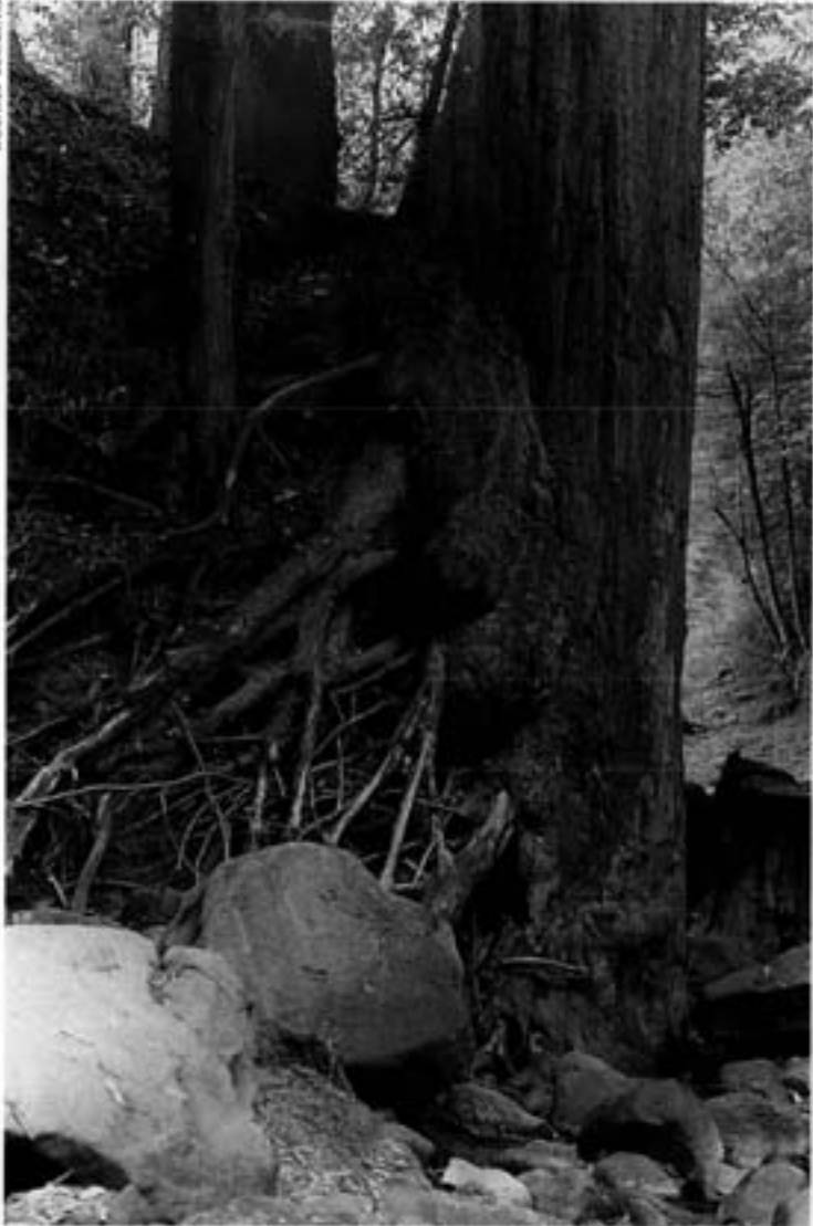
A large Sequoia growing along a streambank in the Humboldt Redwoods State Park. It shows extensive root and trunk development from its exposed, downward-growing lignotuber

stem and were clearly visible to the naked eye. In a few cases, one or two of these buds produce tiny leafy shoots within six months.