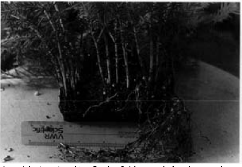
A trunk burl purchased in a Eureka, California, gift shop that is producing both roots and shoots after six months in the greenhouse