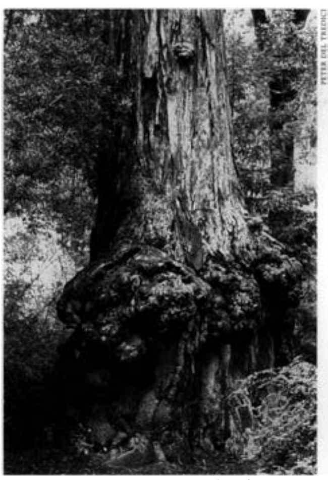
An ancient Sequoia in Big Basin Redwoods State Park showing massive burl development on its trunk.

As is the case with lignotubers derived from the cotyledonary node, those formed by lavered branches possess the ability to generate both buds and roots. How long it takes for a branch to develop a lignotuber after it has been pinned to the ground 1s not known, but it 1s probably at least a year or two. From the ecological perspective, the layering ability of redwood seedlings appears to give them some flexibility in