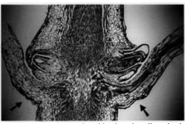
A cross section of a 133-day-old redwood seedling clearly showing the well developed bud clusters in the axils of the cotyledons (indicated by arrows). The stem of the seedling, above the cotyledonary node, is about two centimeters in diameter.