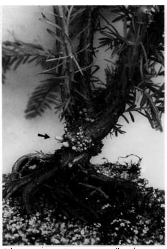
A five-year-old greenhouse-grown seedling showing the proliferation of suppressed buds at and above the cotyledonary node. Bar = 1.0 centimeter.

studies on vegetative regeneration and to collect seeds for cultivation in the Arnold Arboretum's greenhouses.