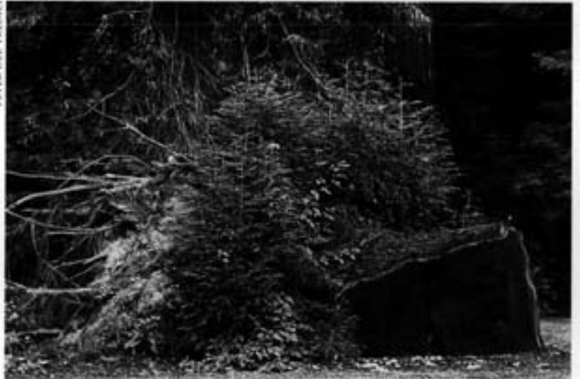
A fallen redwood tree resprouting from its basal lignotuber.

responding to environmental conditions by migrating from areas of shade into areas with better light.