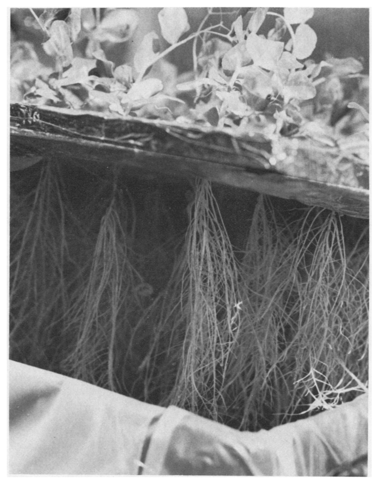
FIG. 3. View looking into the aeroponics box, showing the root systems of pea plants at about 3 weeks from planting. This lot of plants was not inoculated with Rhizobium .

FIG. 2. Diagrammatic cut-away view of the aeroponics box for growing plants. The diagram is not drawn to scale but shows the relationships of the parts.